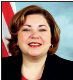
Congresswoman Linda Sanchez