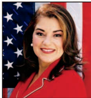
Congresswoman Loretta Sanchez