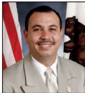
California Senator Tony Mendoza