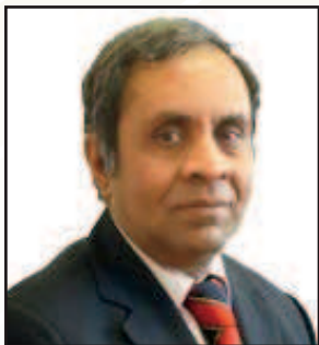
Consulate General of India Venkatesan Ashok